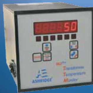
144 x 144 DIN Panel Mounted Version