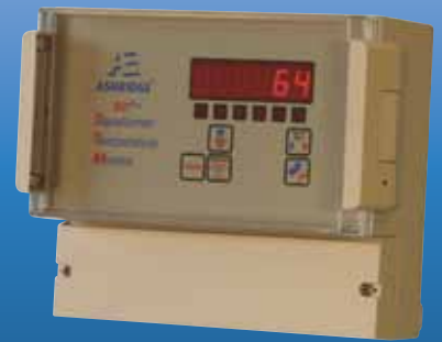
Wall Mounted Version