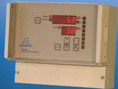
Wall Mounted Version