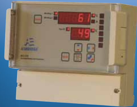
Wall Mounted Version