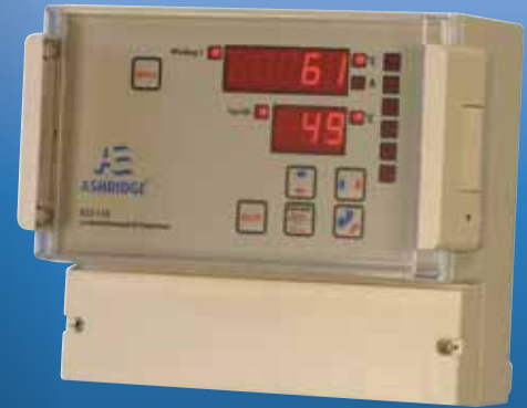
Wall Mounted Version