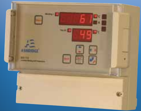
Wall Mounted Version