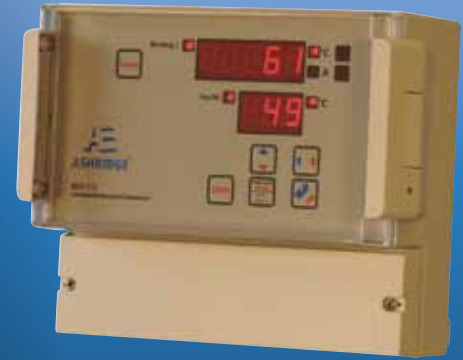
Wall Mounted Version